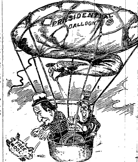
St. Paul Pioneer Press.