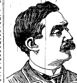
MATTHEW S. QUAY.