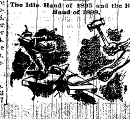
The Idle Hand of 1895 and the Busy Hand of 1899.